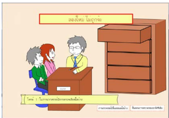
Figure 2. Scene 4: Question answered with a negative result.

Each scene requires users (in this regard, medical students) to interact with a system, and waits for a system response to do next. Provided that the student is keen on the general knowledge of the disease, the system will allow the student to proceed to next scenes. Otherwise, student will be asked if they would need any assistance or condensed materials to be read and understood before moving on to the next step. Initially the design is based on a gaming concept that offers a rewarding point for collection and future redemption. To avoid the pitfalls, typically most medical students will try to serve their challenging need, such motivation is given in the