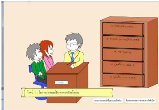
Figure 1. Scene 3: Meet the doctor.

The newly developed system is used to complement the existing Learning Management Systems with contributions in the area of interactive responses and subject matter comprehension.